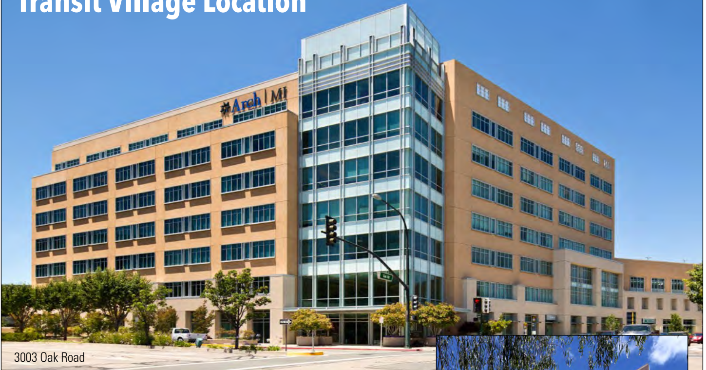
3003 Oak Road

C ontra Costa Centre, located at the Pleasant Hill/Contra Costa Centre BART station, is an award-winning 125-acre master-planned transit village that sets a new standard for transit-oriented communities nationwide for a unique work/live environment. The Centre is located in unincorporated Contra Costa County, and is part of Supervisor Karen Mitchoff's District IV. Smart planning, commuter incentives and the Centre's "Green Fleet" have resulted in a 30% reduction in single-occupancy vehicles commuting to the area. Adding another level of security for the Transit village area, the Centre has established an exclusively assigned Contra Costa County Resident Deputy Sheriff. For more information on the Contra Costa Centre Transit Village visit, www.contracostacentre.com .